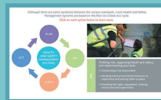
Introduction to Health & Safety Audits