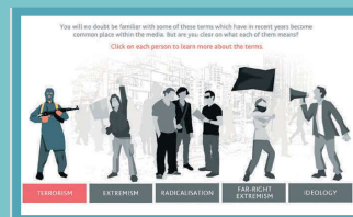
Preventing Radicalisation & Extremism in Education